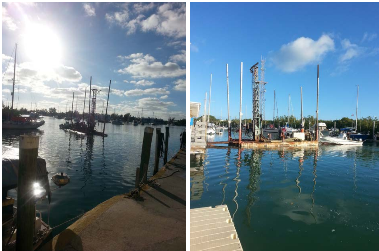
Getting the Barge Docked

Projects: The 19 tie-up pilings along the seawall were replaced this month (see photos below), and staff has rebuilt / overhauled many spare parts for the pumpout program to anticipate the larger volume of people and wear on the equipment.