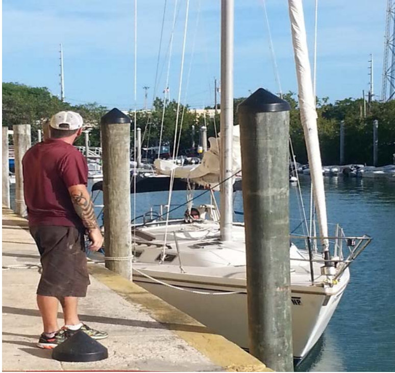
New Pilings and One Happy Customer (AFTER)

Latitude 24° 42' 33.8" N Longitude 81° 5' 29.1" W