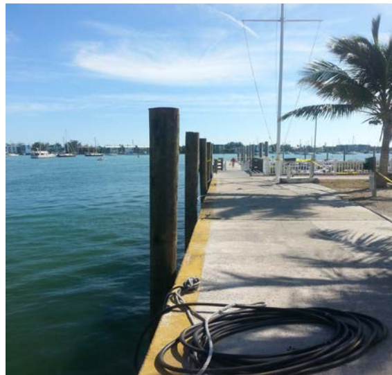
New Pilings (IN PROGRESS)