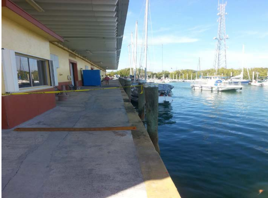
Degraded Pilings (BEFORE)