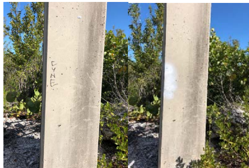
Deputies Walraven and McKnight painted over graffiti on the bike trail at the 56mm.