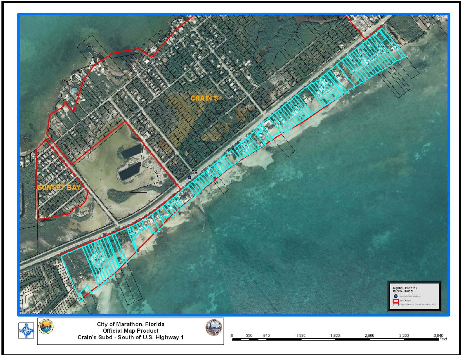
Figure 5 Crain's Subdivision of Grassy Key – Oceanfront Shoreline Properties