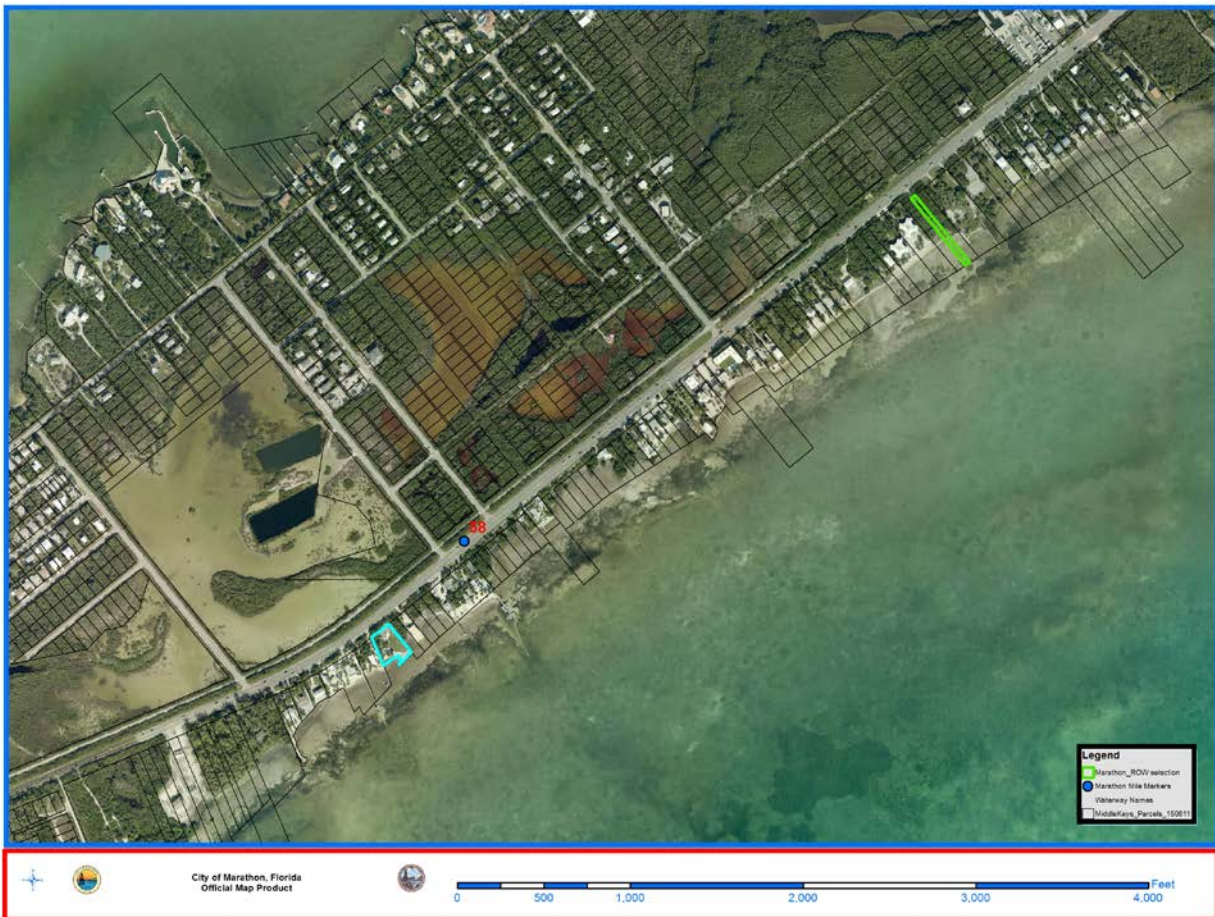
Figure 8 Right-Of-Way Providing Ocean Access

Staff Assessment: Public access to water is not available from this section of Flagler Street. There, are two unnamed streets in Crain's Subdivision that lead from Flagler Street to open water on the ocean. One ocean access point lays fifteen lots away from the proposed abandonment. The second ocean access point lies at the northeastern end of the shoreline properties. Therefore this proposed abandonment will not adversely affect public access to and from the water (See Figure 8).