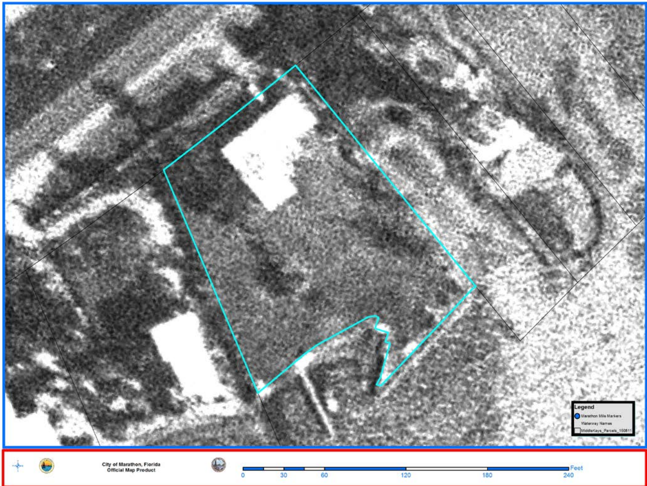
Figure 4 Visible Encroachments in 1975

There are ninety-one (91) individual properties along the oceanfront shore of Crain's Subdivision (See Figure 5). Of these properties, sixty-one (61) are developed (See Figure 6). There are twenty-one (21) similar encroachments along Flagler Street, including the contiguous properties to the east and west. Of the twenty-one (21) encroachments, fifteen (15) involve structural encroachments (walls or buildings). The remaining six (6) encroachments involve landscape or parking encroachments (semi-circular driveways integral to the developed property). There is one area where a similar abandonment was granted in the past involving 19 contiguous properties on the ocean front shore of the subdivision. In addition, many of the improvements on properties adjoining Flagler Street have zero (0) or near zero front setbacks (See Figure 7).