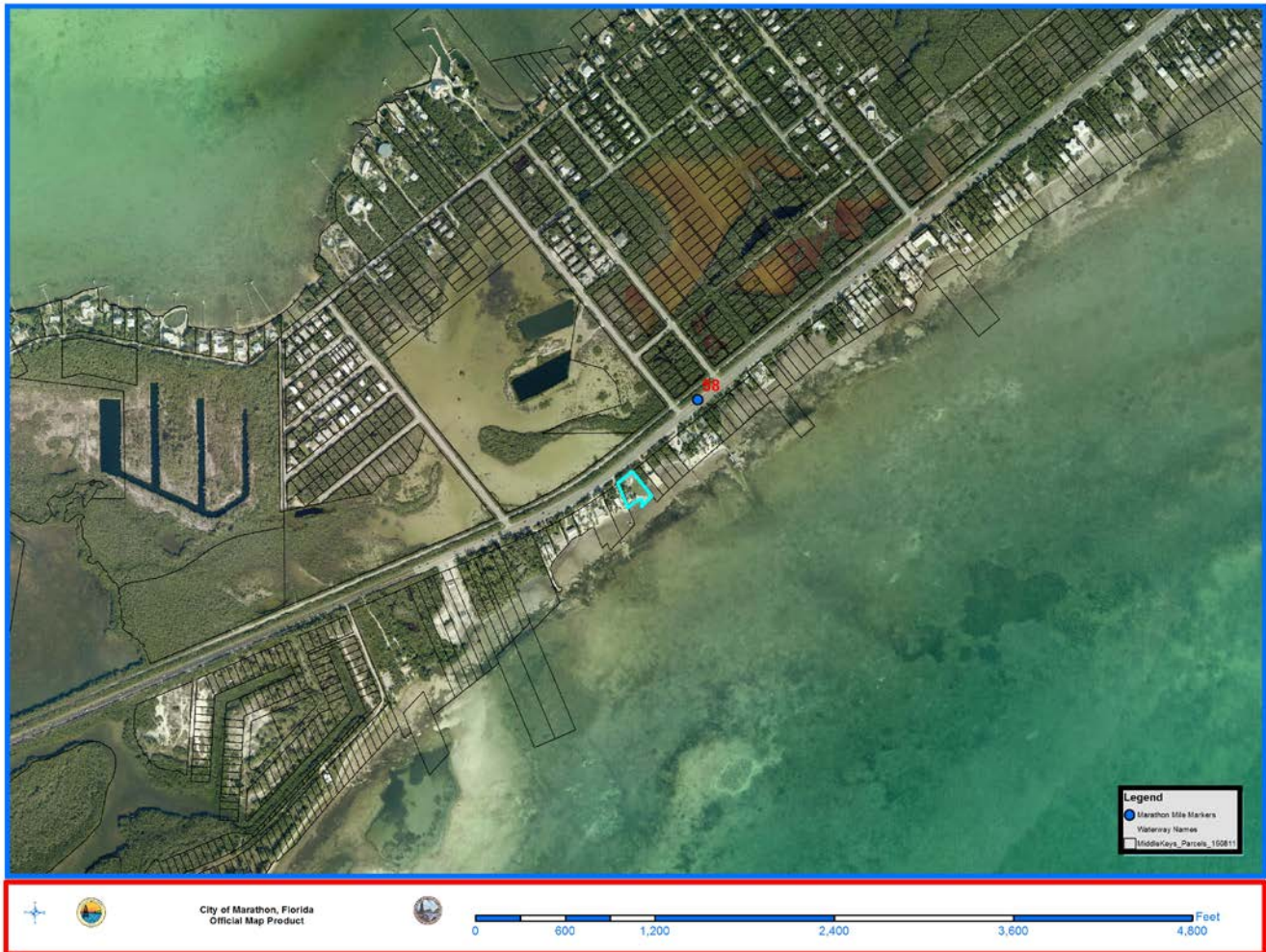
Figure 1 Location Map