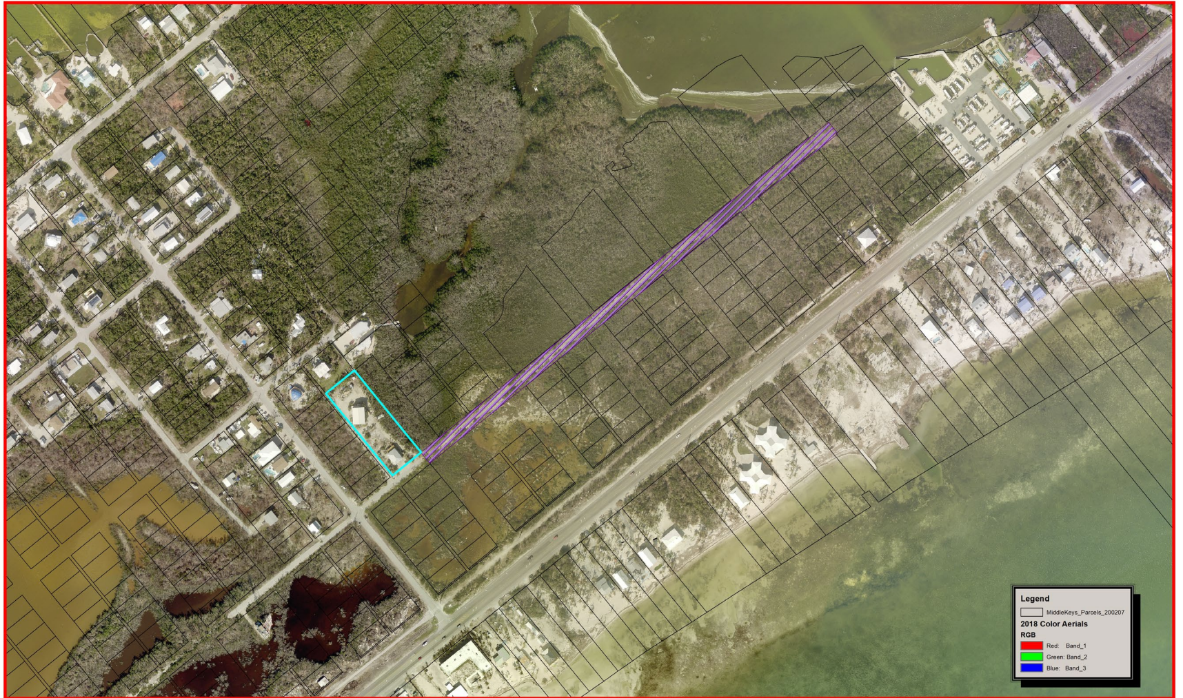
Figure 2 Crain's Subdivision of Grassy Key – Crain Street Removal