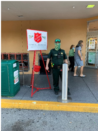
Throughout the holidays, Deputies volunteered time for the Salvation Army.