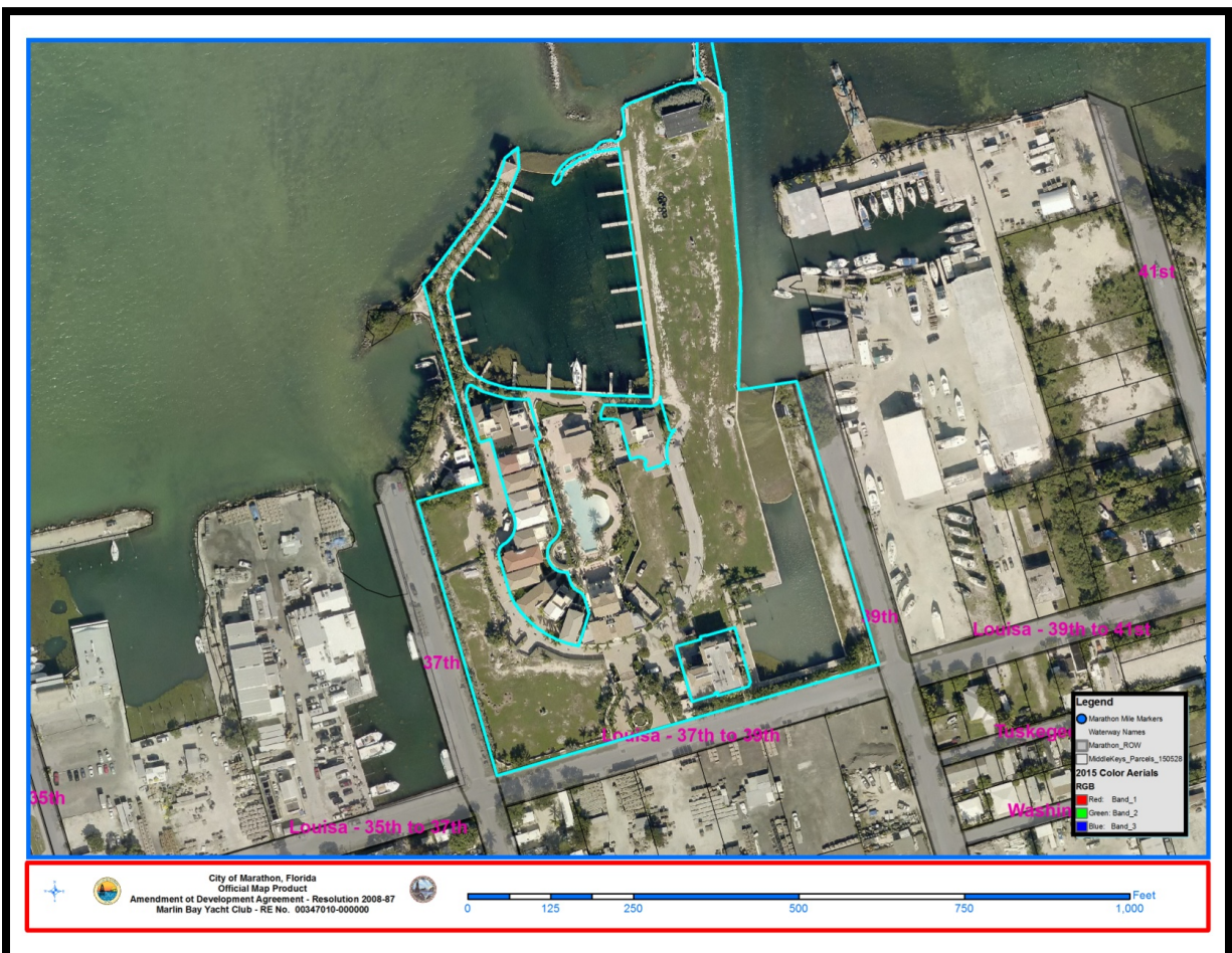
Figure 1 Location Map

PROJECT SIZE: Approximately 344,069 square feet (7.90 acres) of upland / submerged land