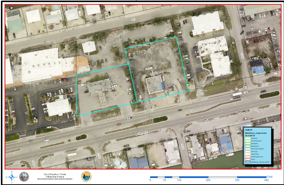
Figure 1 Project Site

REQUEST: A Conditional Use Permit for the authorization of development of the subject property having the real estate number 00334560-000000 & 00334600-000000.