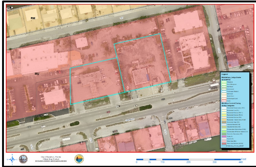
Figure 3 Zoning Map

ZONING MAP DESIGNATION: Mixed Use (MU). See Figure 3.