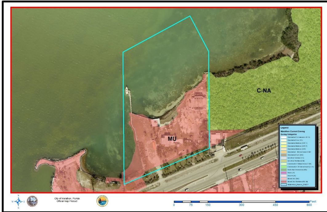
Figure 3 Zoning Map

LOT SIZE: Total acreage: Approx. 80,215 sq. ft. of uplands.