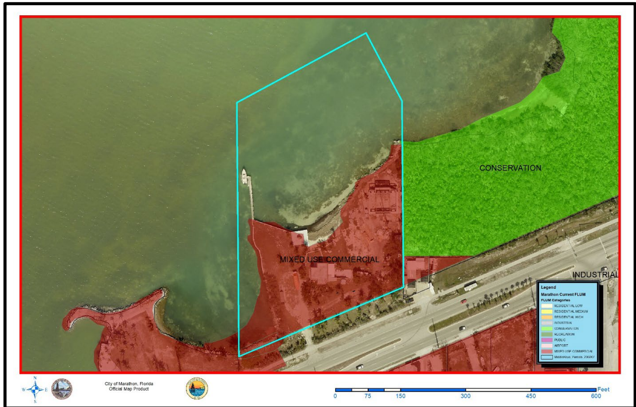
Figure 2 Future Land Use Map

Mixed Use Commercial (MU-C). See Figure 2.