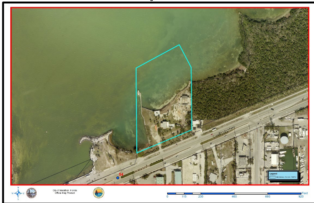
Figure 1 Project Site

LOCATION: The project site is located at 12670, 12700, & 12800 Overseas Highway. See Figure 1.