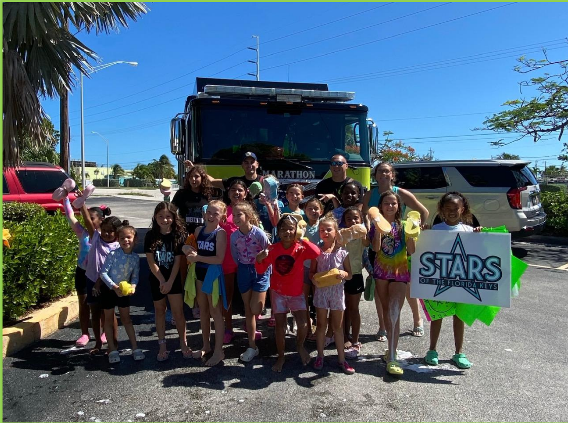
A -shift attended a carwash to benefit the Stars of the Florida Keys on this sunny day!