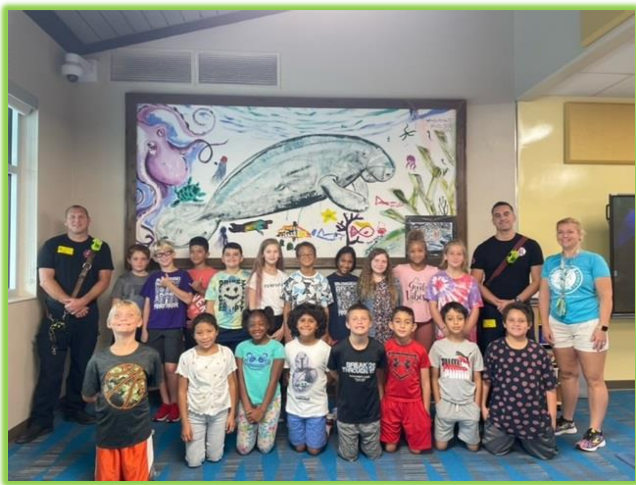
A fun and rewarding day for our firefighters and these children!