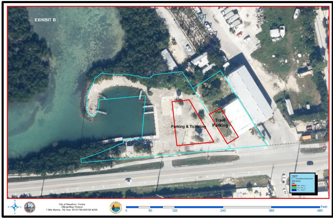
EXHIBIT "B" VISUAL REPRESENTATION OF EXTEROR LAND TO BE LEASED