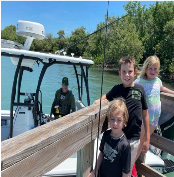
Figure 1 joined the Switlik Elementary fishing club for safety and fish education