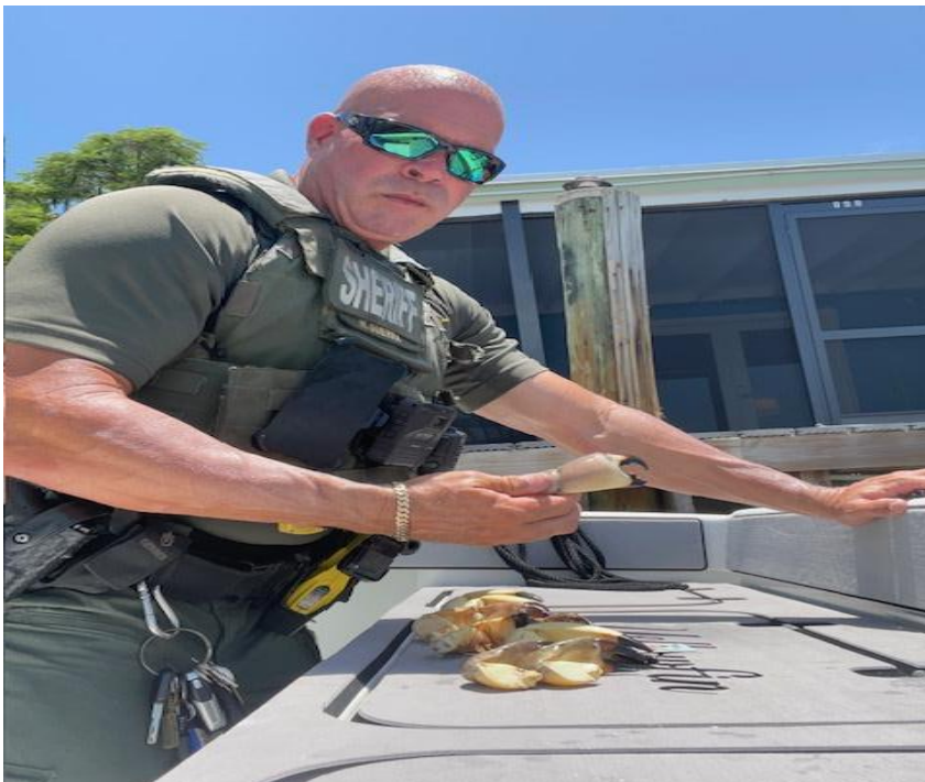
Out of season Stone Crab