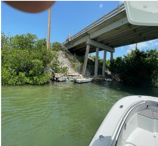
Figure 2 Addressing illegal vessel mooring and trash on 20 st bridge