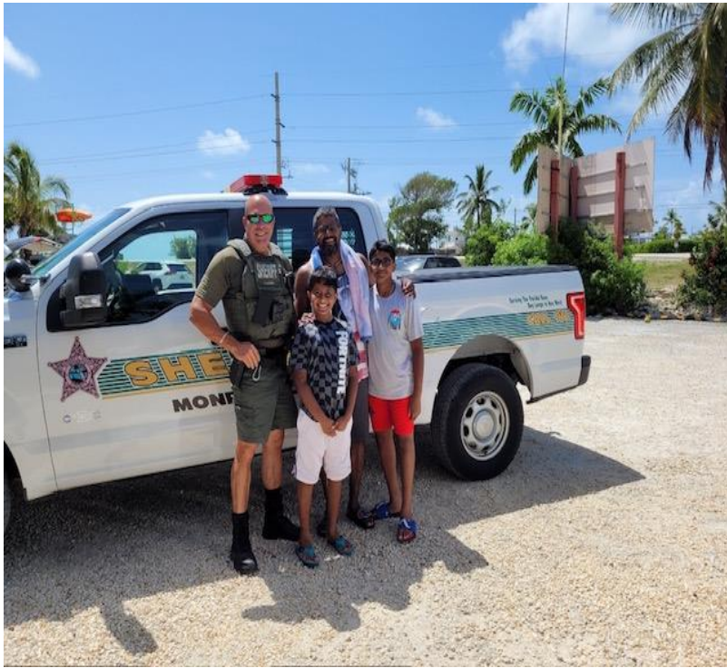
Nice family from India.