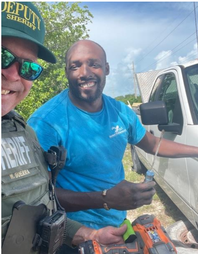
Assisting motorist with a broken tie nut. Used my personal impact gun to assist