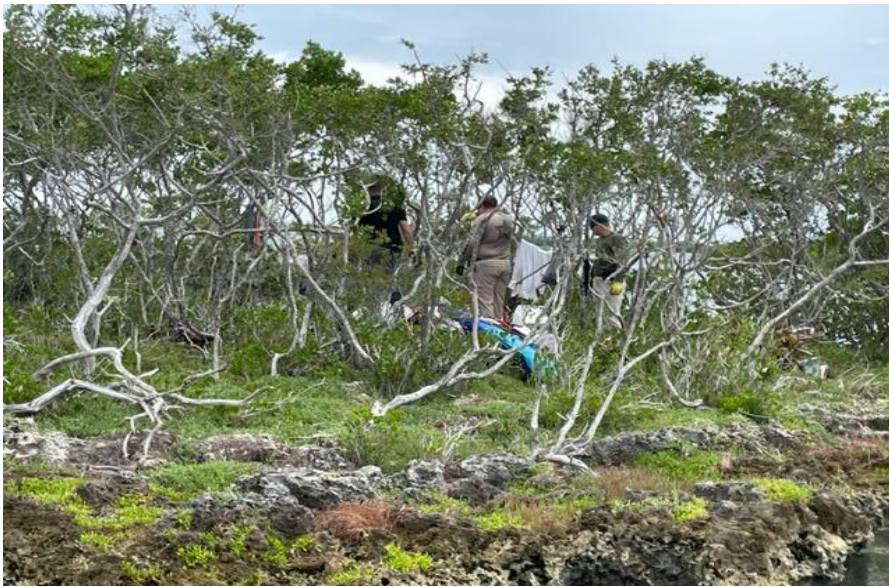
Assisted Marathon city Manager on Island belonging to the Cane Point Museum.