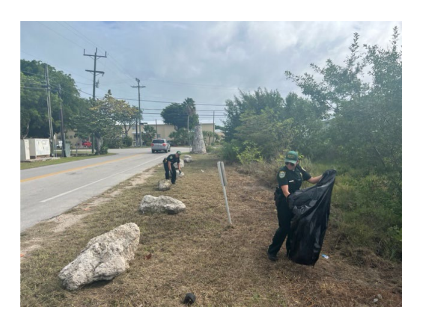
Deputies Daniels, Diaz, and Mortenson clean up trash along Sombrero Blvd just before Sombrero Beach Road.