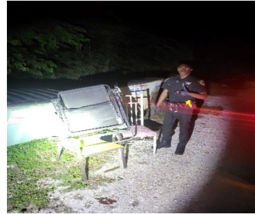
15 th Street zone improvement