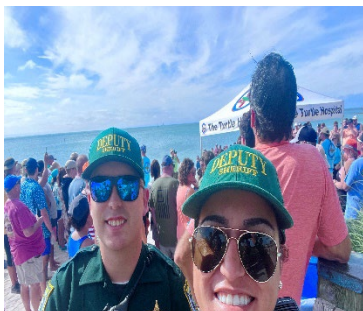
Turtle release at Sombrero Beach