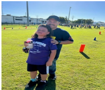
Stanley Switlik Jog a Thon