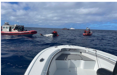
Plane crash agency assist