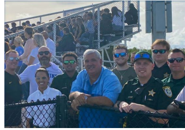
Cross Country Teams send off