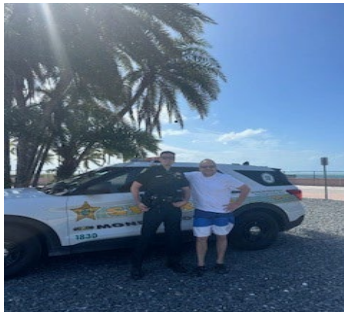
Socializing with our visitors