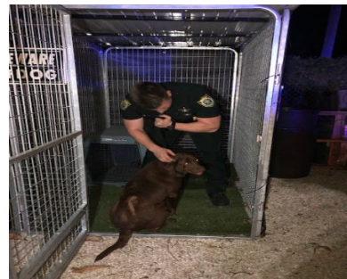
Rescued puppy taken to the Shelter