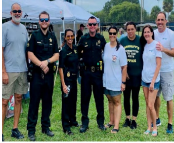
Joy on the Rock event