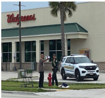
Deputy addressing quality of life concerns