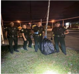
53 rd Street and Ocean Terrace zone improvement