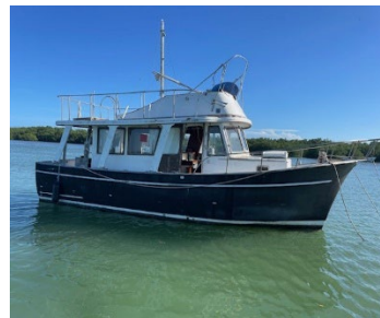
Derelict vessel investigation of the month