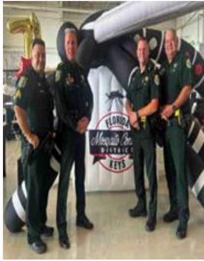
Florida Keys Mosquito Control Open House