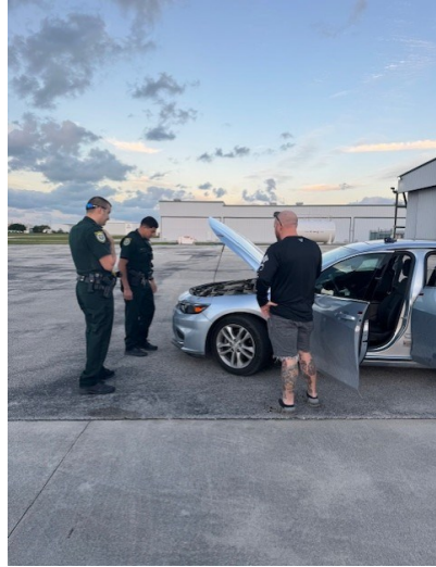
K9 and vehicle searches