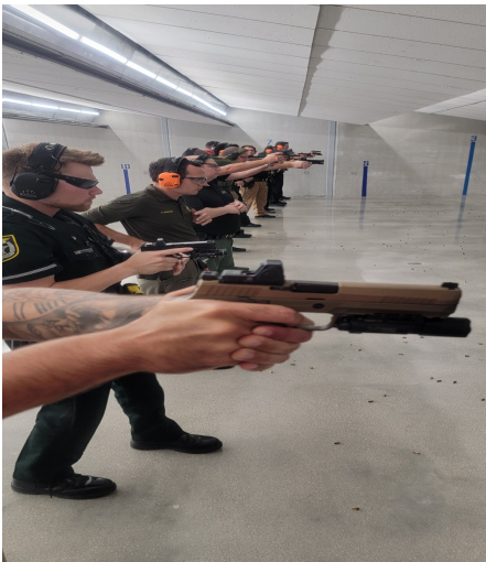
Red dot course