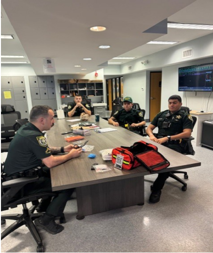
Overview of our newly issued medical bags