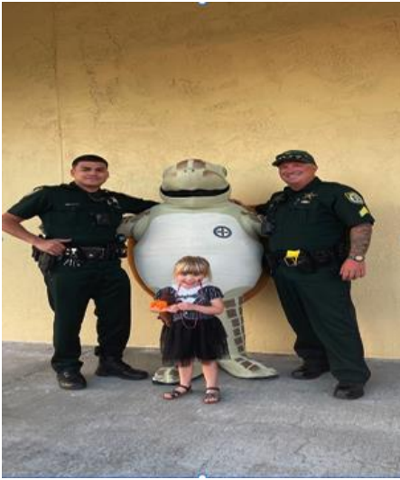
Trunk or Treat at Gulfside Village