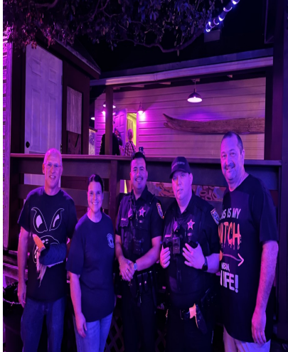
Crane Point Museum Event