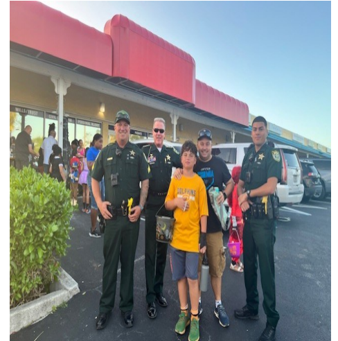
More Halloween Fun!