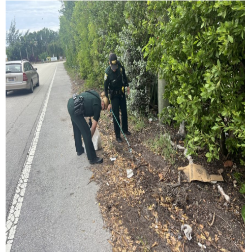
Clean up on 53rd Street