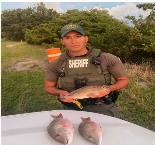
Deputies Guerra and Guardiola staying busy with resource cases and investigations