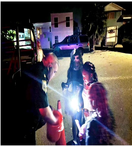
Halloween at the Fishbowl