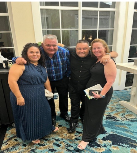
Annual Rotary Awards