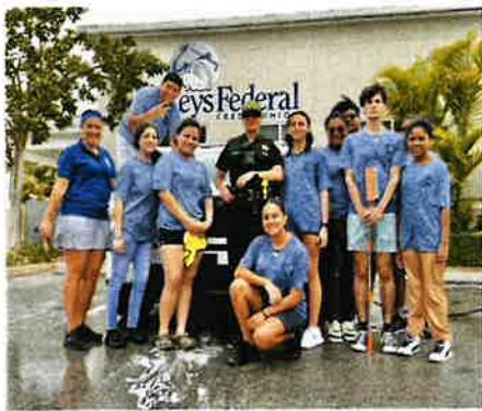
Supporting the 'MHS Champions for Change' fundraising.