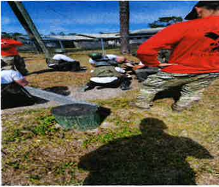
Deputies attending a Tactical Medical Service Training