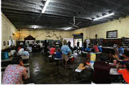
Meeting with residents of Boot Key.