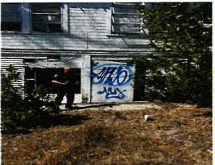
Covering up Graffiti on a vacant home.