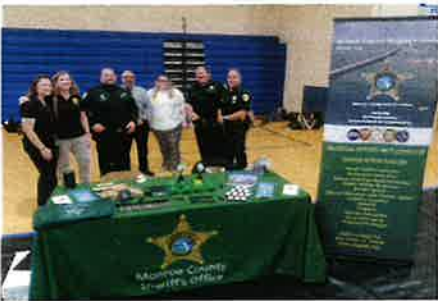
Career Day at Marathon High School