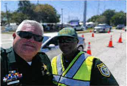
Great Turnout at the Seafood Festival