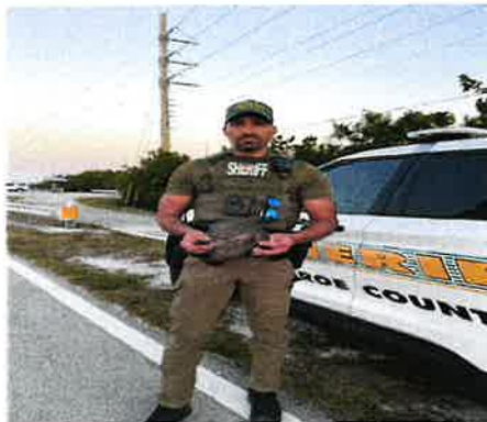
Deputy Guidarinu stayed busy with multiple resource checks.