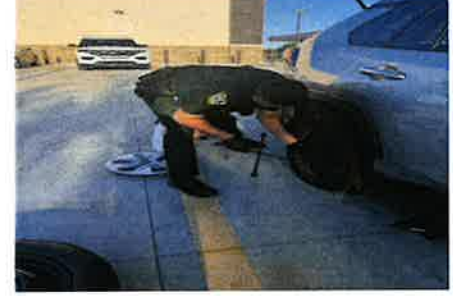
Always willing to help.