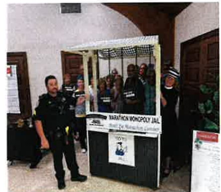
Helping out at the St. Columbia Episcopal Church.