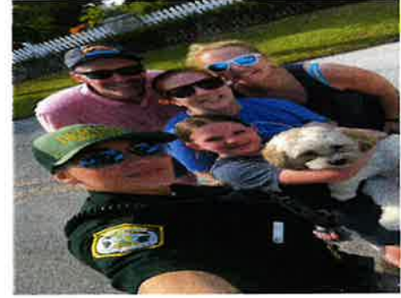
loose dog relocated with owners.