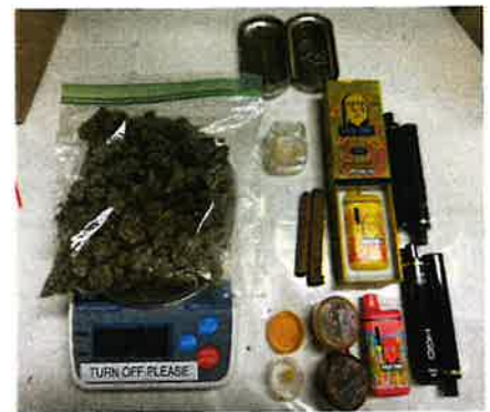
Great pro-active policing.