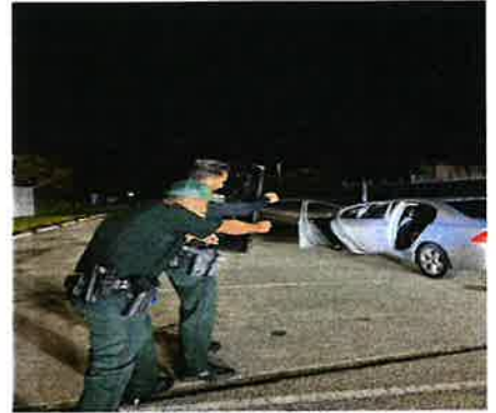
Felony Traffic Stop Training