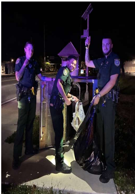
Bus stop clean up