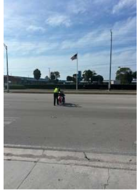
Painting out Graffiti and helping a disabled resident cross the road.