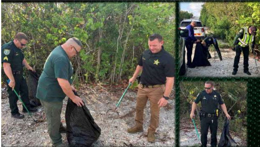
20 th Street cleanup!