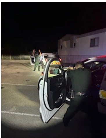
Sgt. Hill's squad conducted felony stop training.