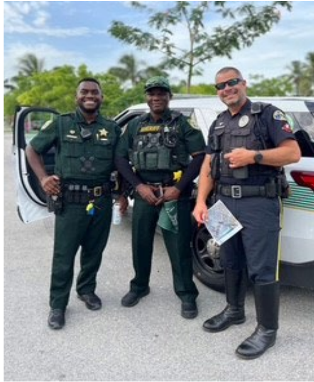
Dep. Mompont provided security for the Pride Parade.