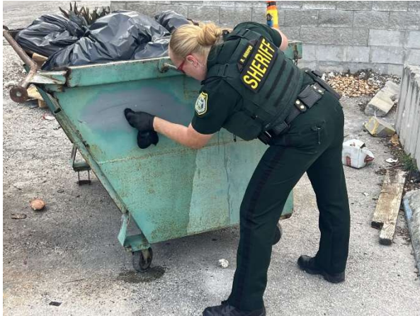
Painting out Graffiti