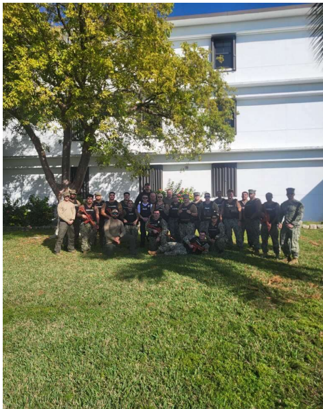
SWAT Training w/ NAS Police