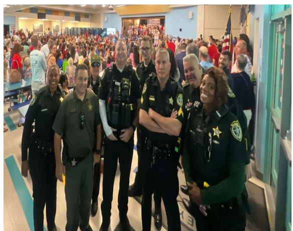
Stanley Switlik Red, White and Blue Day