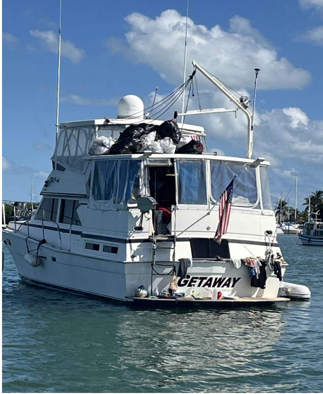
Vessel issued criminal citations by Dep. Guerra