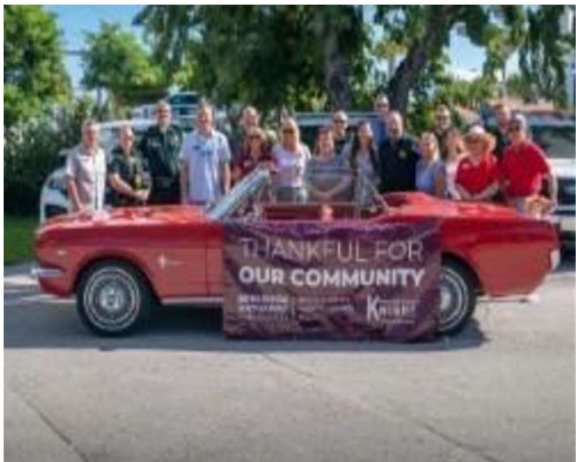
Berkshire Hathaway Gift Card Donation