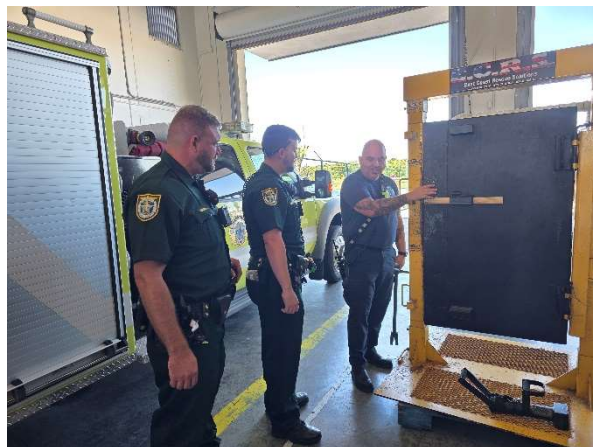
Door Breaching Training w/Fire