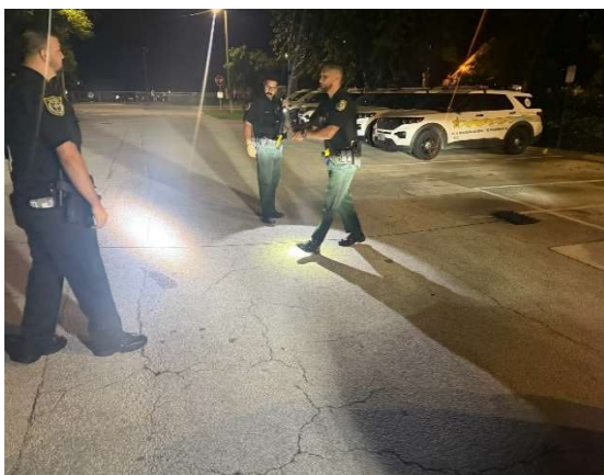
Stinger Spike Training