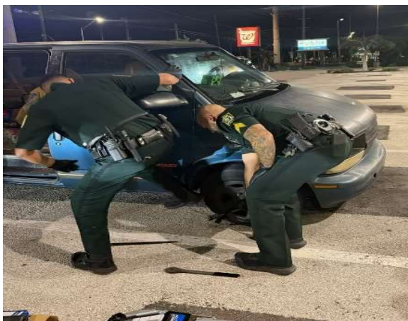
Assisting a Driver With a Tire Change