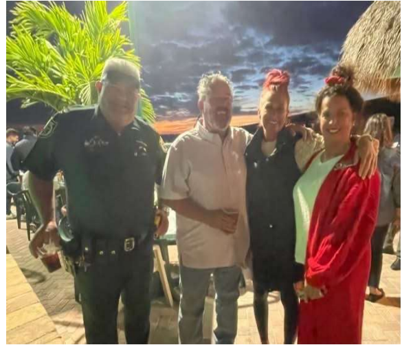
Chamber After Hours at Sunset Grill