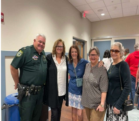
City Council Meeting