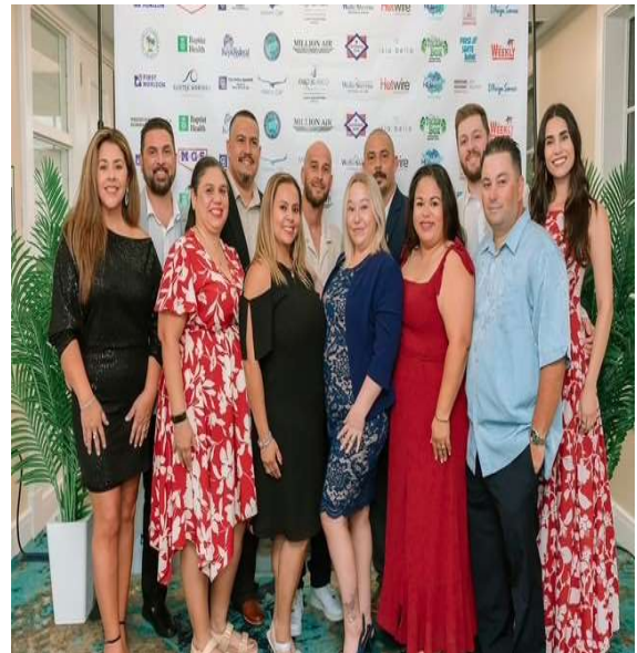
Marathon Chamber Event