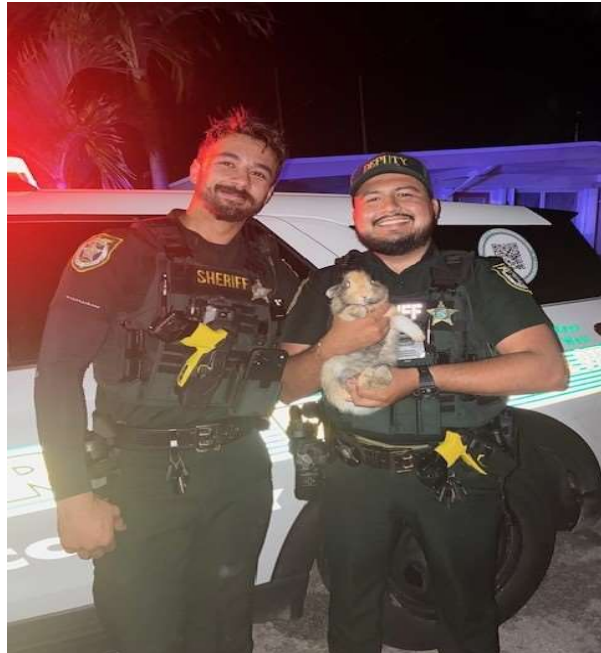
Rabbit rescued by Deputies