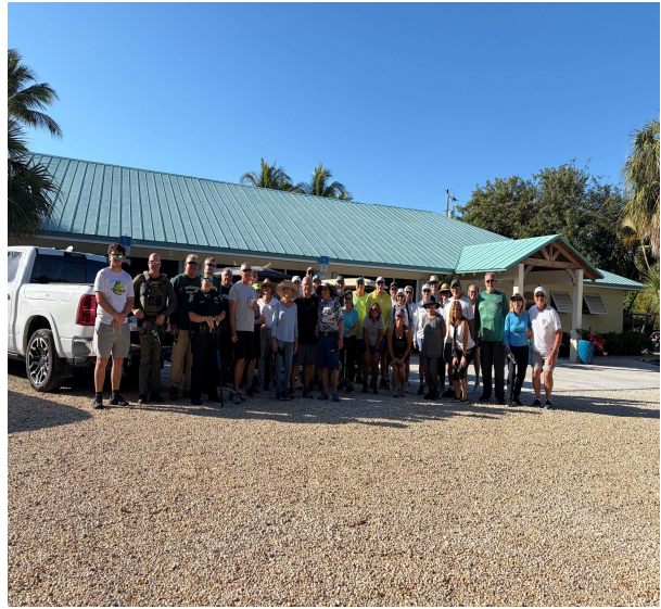
Duck Key POA Cleanup