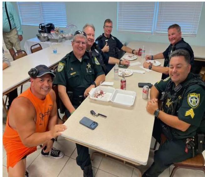
Marathon Masonic Lodge 1st Responder Dinner