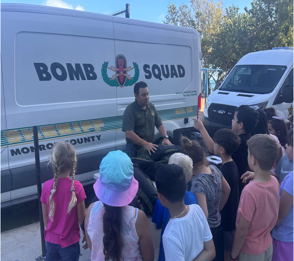
Stanley Switlik Career Day