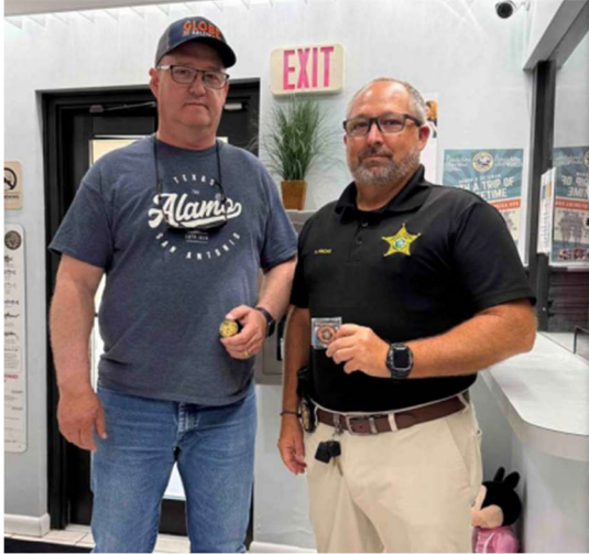
Trading Coins with an AZ Officer