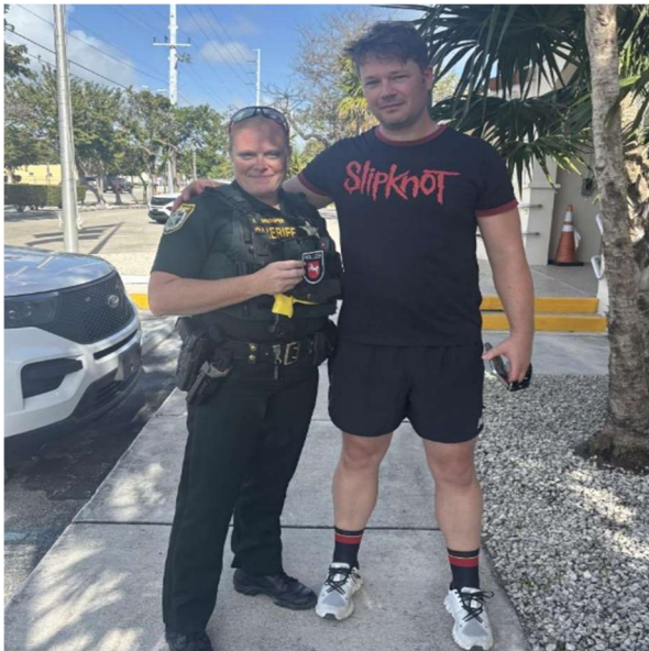
ep. Mumper Trading Patches