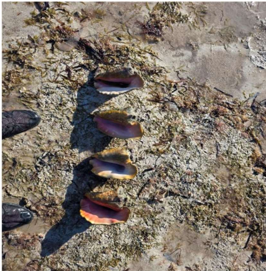
Photo from Queen Conch Case