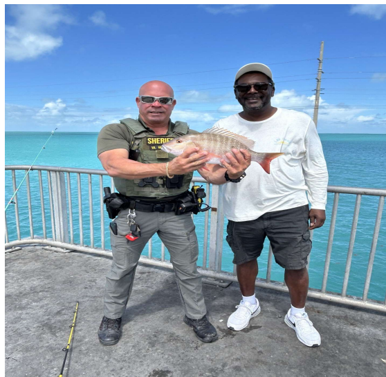
An Angler with a Great (Legal) Fish!