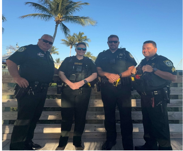
Sombrero Beach Easter Event