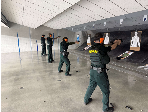
B Shift Range Training