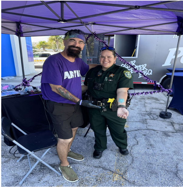
Surf Style Grand Opening