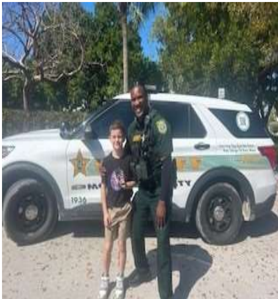
Lost Phone Returned to its Owner