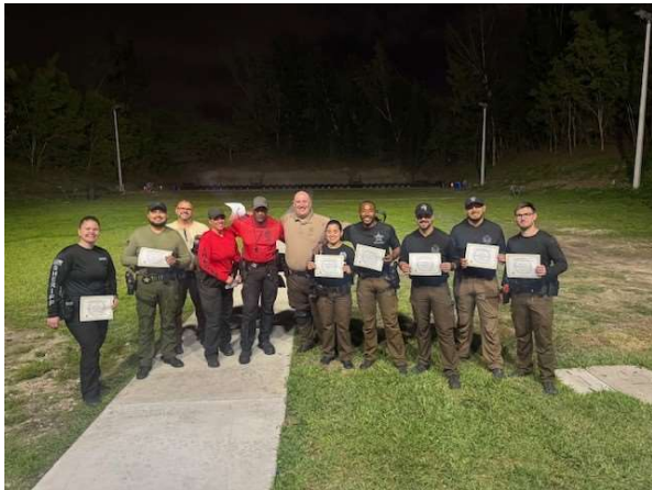
Advanced Rifle Course