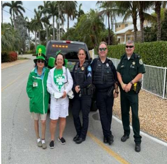
KCB St. Patrick's Parade