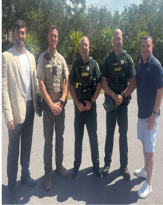
Governor Candidate Visit