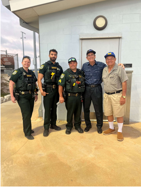
MHS Baseball Game