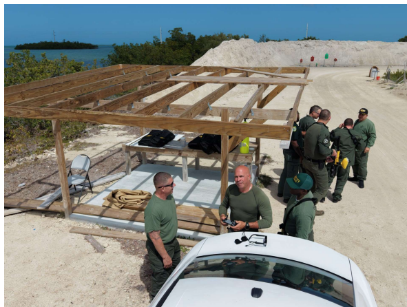
SRT Team Training