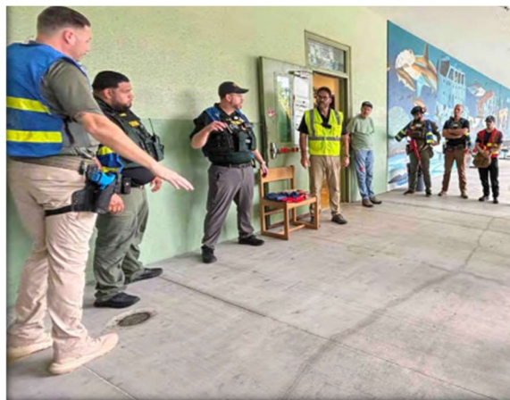
ALERRT Train the Trainer Class