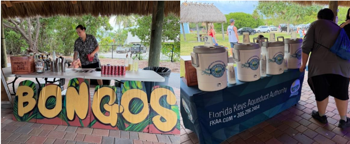
Bongos and the Florida Keys Aqueduct Authority kept visitors refreshed.