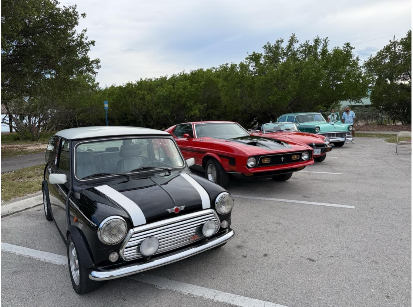
A few of the vintage vehicles competing in the classic car show.