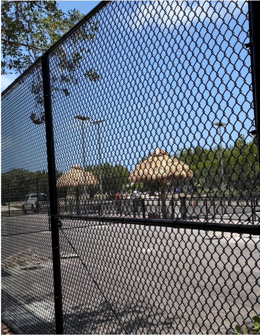
The pickleball courts at Oceanfront Park are nearly complete.